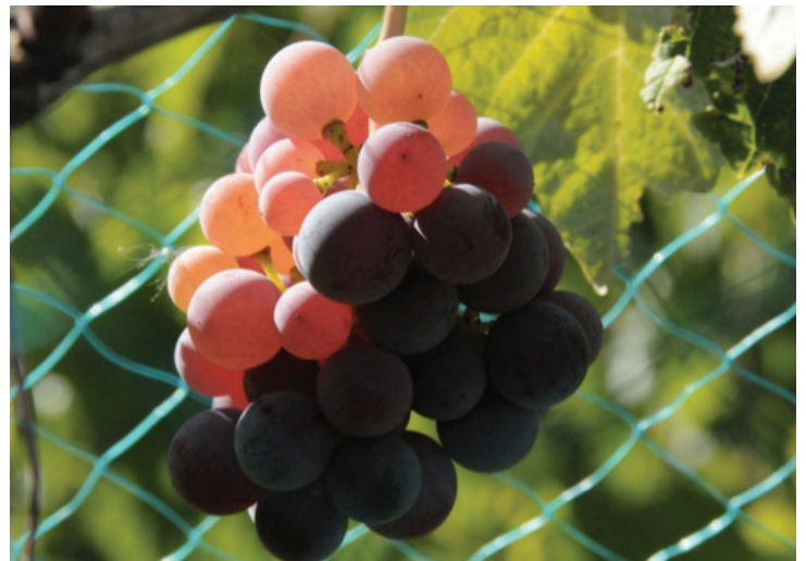
All photos from the Montana Stories section were graciously provided by the farm or organization associated with each photo.