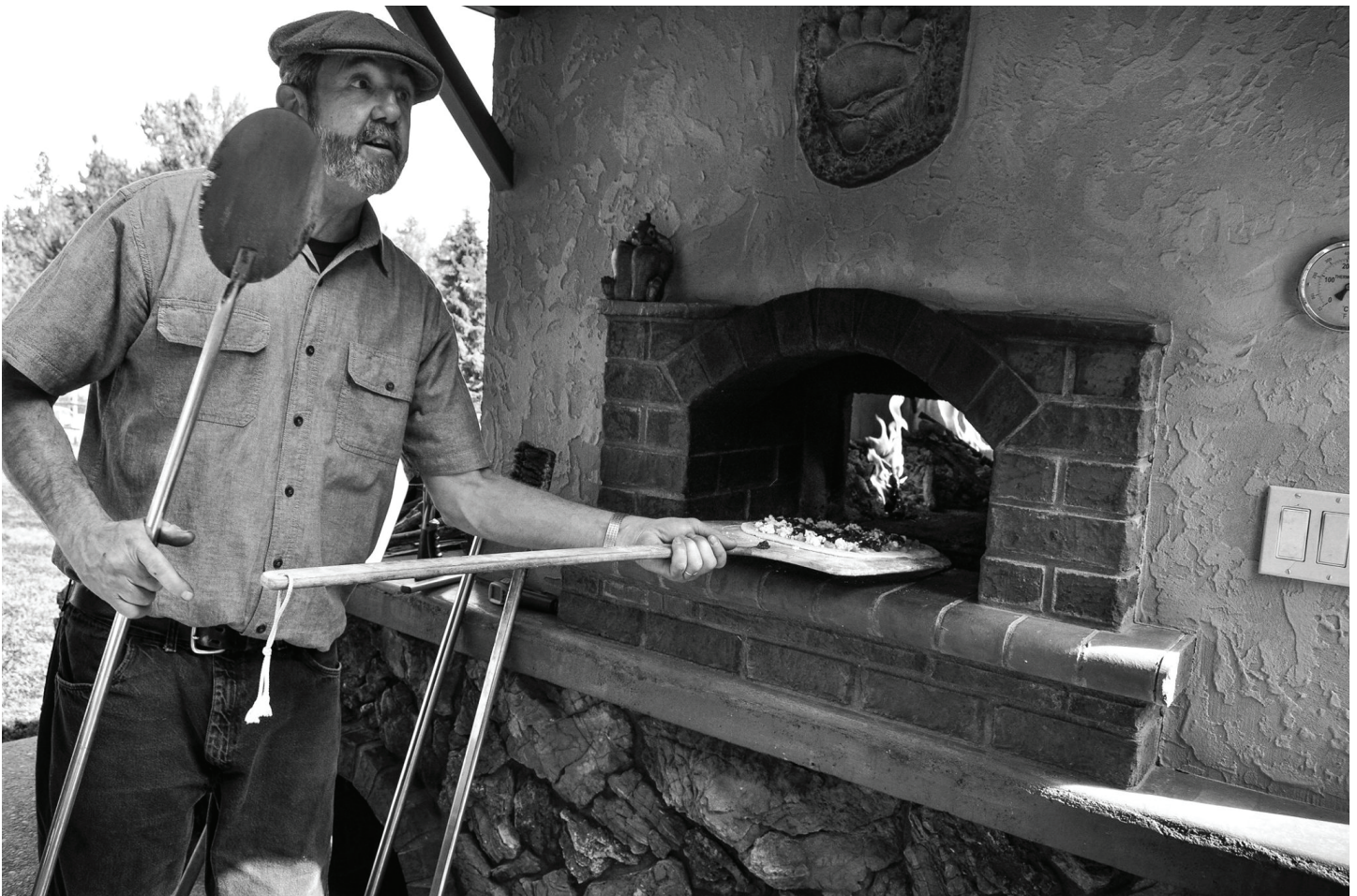
Image: Preparing a brick oven pizza for participants on the Farm to Fork Bike Tour.

Montana Department of Commerce - Office of Tourism and Business Development