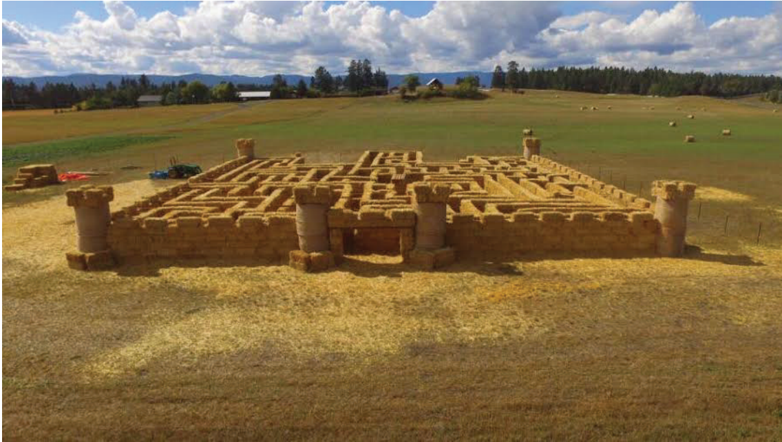
Image: The straw bale maze at Whitefish Stage Organic Farm.

your family and existing workers, will you have sufficient funds to hire people? Or attract the appropriate kinds of volunteers? Hiring people affects your bottom line, but if it's the difference between offering a good attraction and charging more, choose charging more. Remember, people want the "experience," so it needs to be worth what they are paying for.