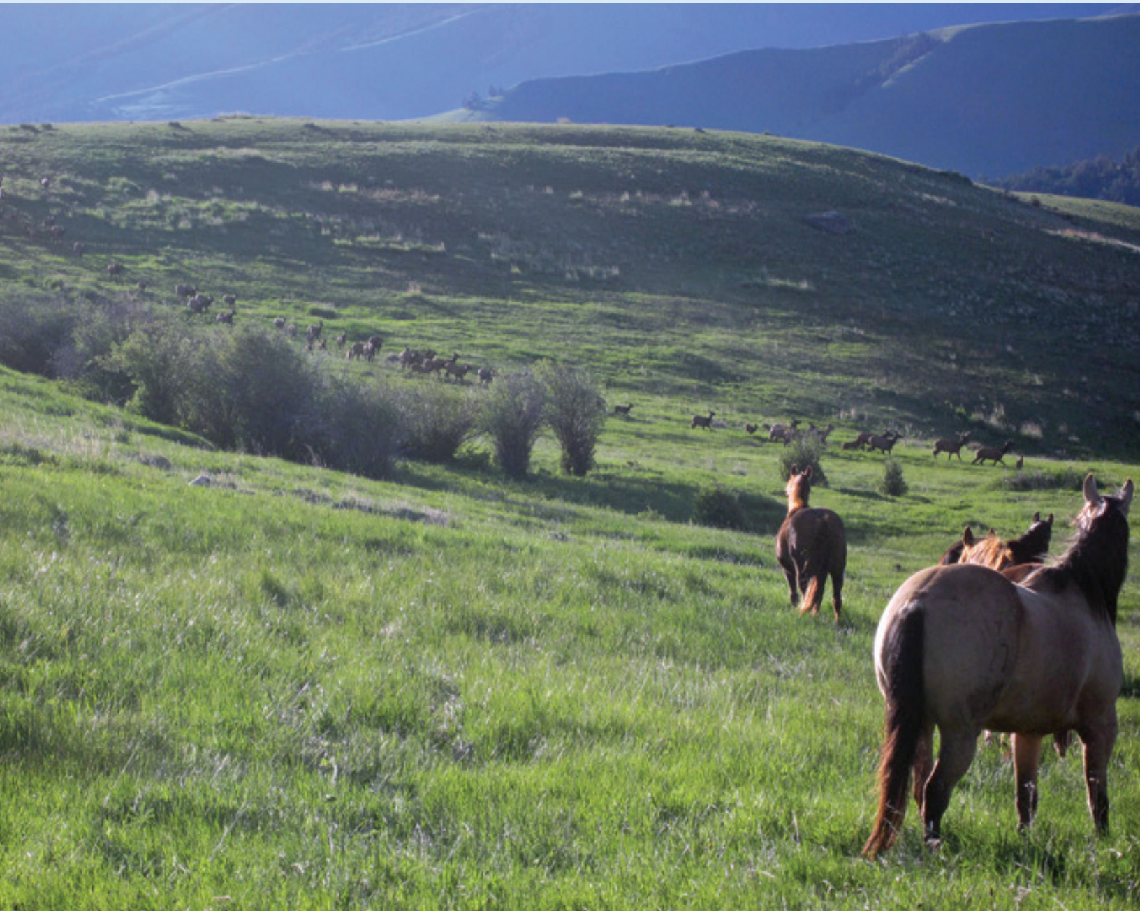
Image: Horses at the B-Bar Ranch watch a herd of elk move through the field. Front cover image: Scottish Highland cattle at ABC Acres.