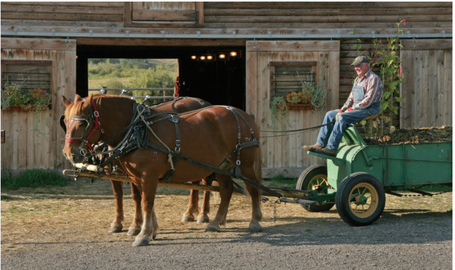
Image: Horse-drawn wagon, from B-Bar Ranch.

Reach out to our marketing staff for guidance on how to start, market, and maintain your agritourism enterprise. In addition to our marketing consultations, our website offers a sampling of agritourism activities available in Montana. Additional resources for agritourism activities are added on a regular basis, so check back often.