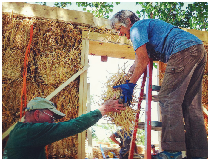
from top, corn harvest work party (Bob Quinn Ranch); 2016 AERO Expo and Annual Meeting carrot taste test with Fresh Root Farm; strawbale work party (River Ranch).