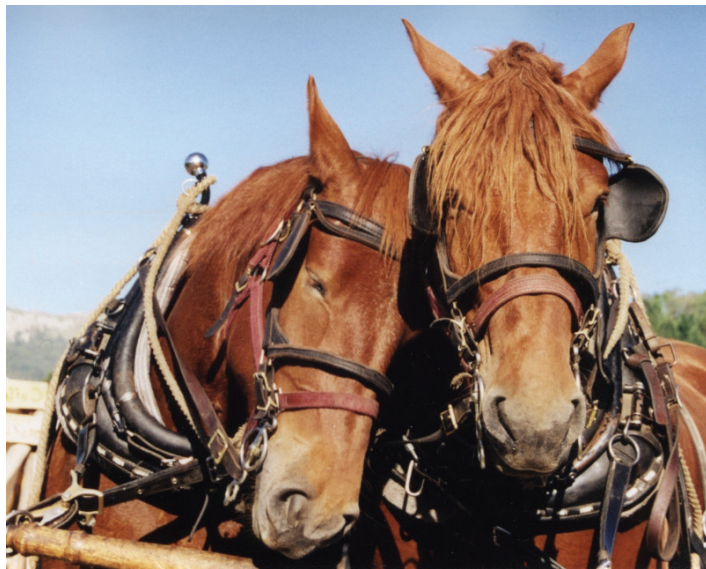
Image - A pair of Suffolk Punch Draft horses at B-Bar Ranch.

In the 2017 Legislative Session, Montana passed House Bill 342 which can be found here: http://leg.mt.gov/bills/2017/billhtml/HB0342.htm . This new law impacts producers regarding the reduction of their exposure, potentially bringing their premiums down when providing agritourism activities. The intent of the law is to make insurance more affordable for agritourism activities. Prior to this law, a farmer could be held liable for injuries caused by the inherent risks of the agritourism activity. The law defines inherent risks as dangers or conditions that are an integral part of the activity and cannot be prevented by the use of reasonable care. Now, an agritourism participant is responsible for his or her injuries or damages that result from the inherent risks of the agritourism activity.