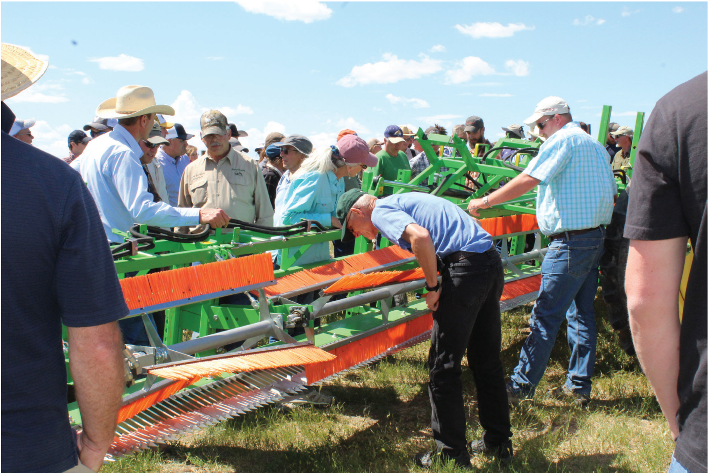
Image: Inspecting new equipment at the Manuel Farm during a tour.

your operation, even if it involves agritourism; they should never be “the last to know.” They will explain what is and is not allowed under your current policy. Since every farm and every farm activity is unique, any agritourism activities in addition to your usual farm activity needs to be discussed with your insurance agent. That is the only way you will know what is currently covered under existing policies and what additional coverage you might need to cover your new agritourism activities. Start the conversation by asking