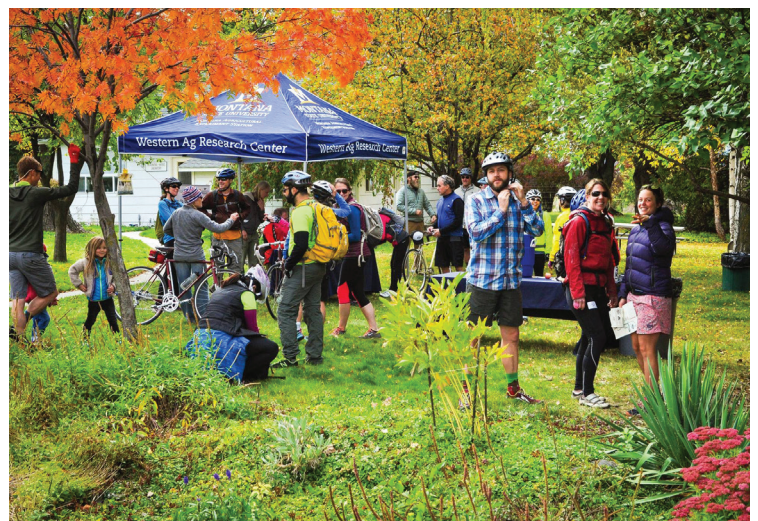
Images - Upper left: A hay-ride at Red Hen Farm in Missoula Lower right: Farm to Fork Bike tour in the Bitterroot.

All of the above types of agritourism can help foster meaningful connections between the consumer and the farm. From that, long-term relationships can be forged. This customer loyalty and repeat business is key to the success of many agritourism businesses. Another category of temporary on farm visitors include interns, apprentices, volunteers, and WOOFers (World Wide Opportunities on Organic Farms). These work based educational opportunities allow folks to contribute and learn in a number of areas, while sometimes staying on site for the duration of their experience. Note that our use of the terms “intern”, “apprentice”, “volunteer”, and “WOOFer” do not necessarily correspond with the US Department of Labor’s definitions and each opportunity is specific to the farm that’s listing it. In Montana, the Community Food and Agriculture Coalition has some great resources on the legality of labor laws. For more information, visit their site here: https://www.farm-linkmontana.org/work-program/info-for-hosts/