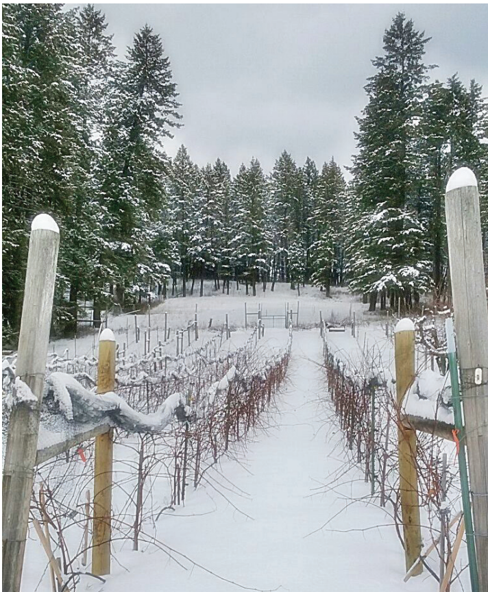
Image: The vineyard in winter at Spotted Bear Vineyard and Lavender Farm.

University of Minnesota - Building a sustainable business