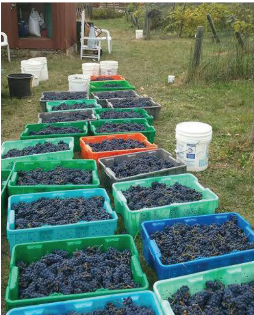
Image: Cleaning the grapes after harvest at Spotted Bear Vineyards and Lavender Farm in Polson.

These are just a few of the questions you need to consider before launching into an agritourism business. There are many steps that should be taken in order to be confident your agritourism business is a good fit for you and your customers. Having patience, being organized, communicating well with others, and adapting to change are all necessary qualities. It is important to think about the goals you are looking to achieve with this venture - Are you interested in making a supplemental income? If so, how much money will you need to support these new activities? If you are not interested in supplemental income, have you calculated the costs involved in launching this venture? Can other parts of your business pay for your new ventures?