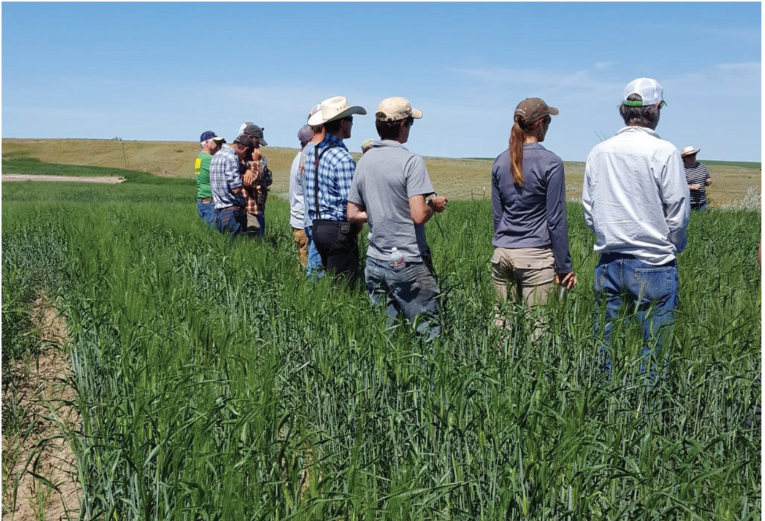
Left and right images: Touring the Underground, by AERO.